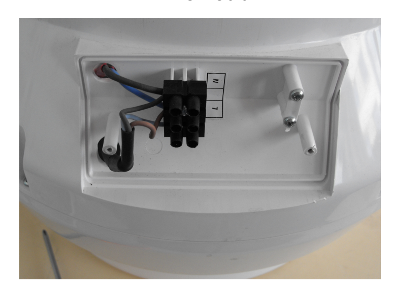
VENTS VKS 315