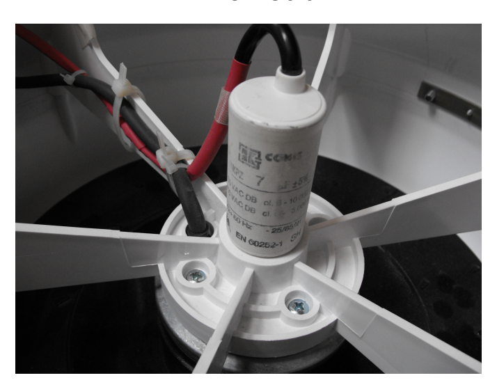
VENTS VKS 315