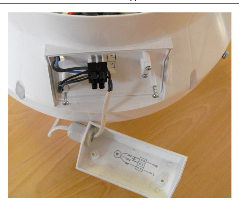
VENTS VK 315