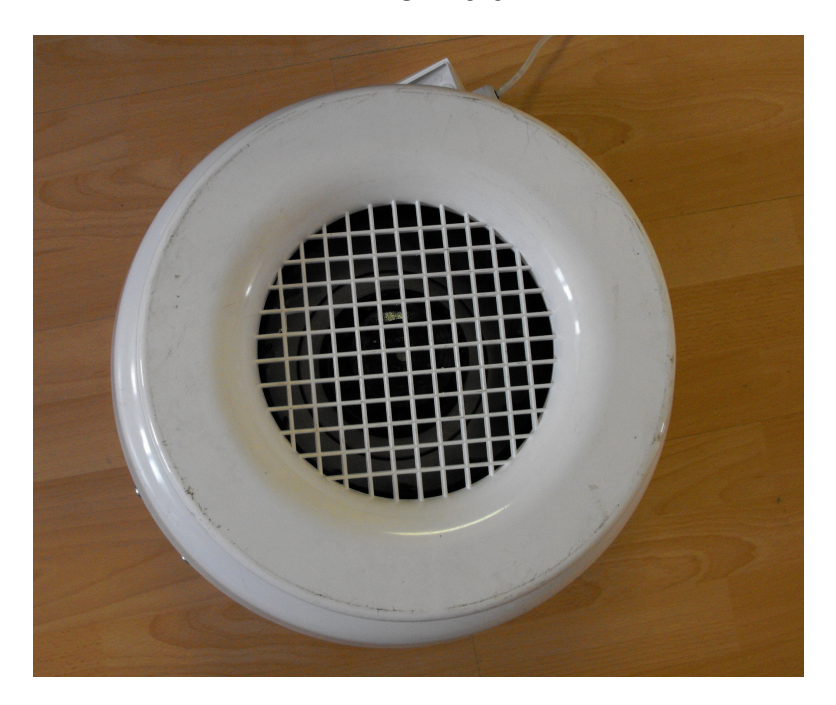
VENTS VK 315