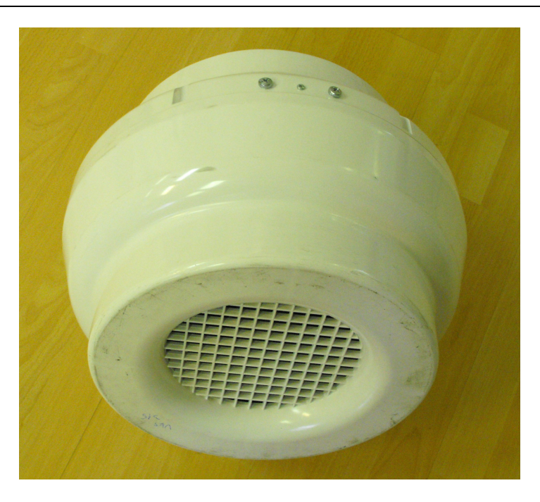
VENTS VKS 315