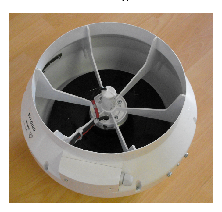
VENTS VKS 315