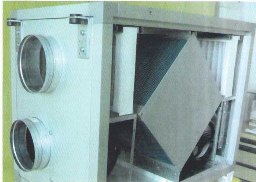
VENTS VUT 500 H