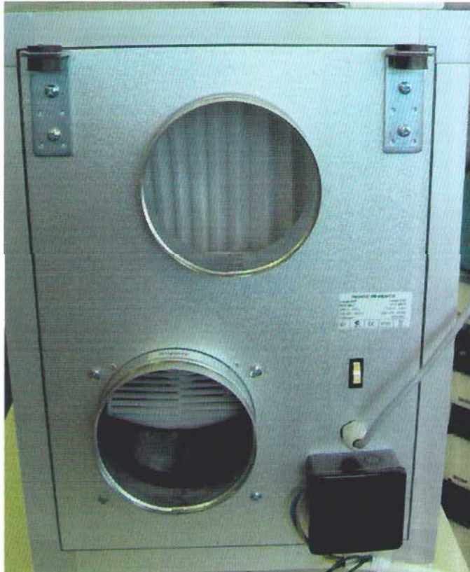
VENTS VUT 500 H